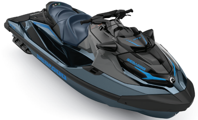
● Abyss Blue and Gulfstream Blue