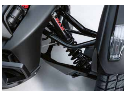
FULL KYB HPG SHOCKS Front and rear KYB HPG shocks with remote