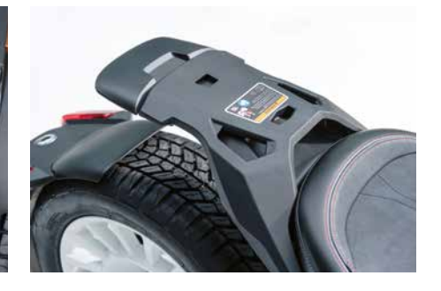
MAX MOUNT STRUCTURE Makes the unit 1+1 ready. It also increases the adjusters and 1 inch of extra suspension travel carrying capacity for different storage options.