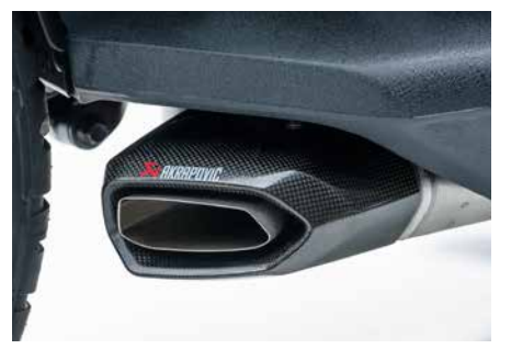
AKRAPOVIC EXHAUST Unique sound signature and high-end exhaust.